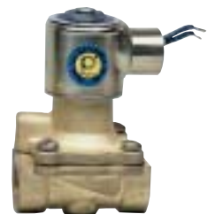
SERIES 80 DIRECT LIFT