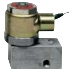
SERIES EH20 HIGH PRESSURE IMPACT TYPE 2-WAY NORMALLY OPEN

HIGH PRESSURE Super high pressure ratings with bubble tight sealing. Ratings to 3000 psi.