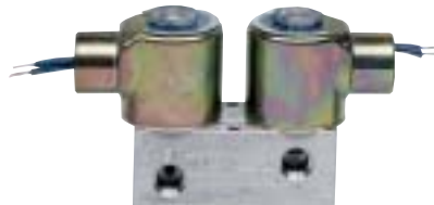
SERIES 20 3-WAY NORMALLY CLOSED