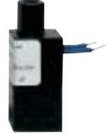
3-WAY LEAD WIRES