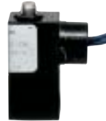
CONDUIT LEAD WIRES