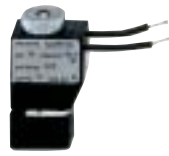
2-WAY LEAD WIRES

Smallest in the line — low cost, low power consumption, high performance. Ideally suited for solid state controls.