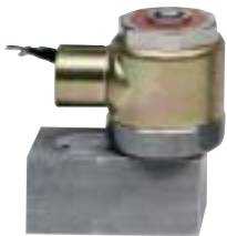
SERIES EH20 HIGH PRESSURE EXPLOSION PROOF

HIGH PRESSURE Super high pressure ratings with bubble tight sealing. Ratings to 3000 psi.