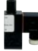
3-WAY W/FEMALE DIN CONNECTOR