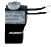
3-WAY LEAD WIRES