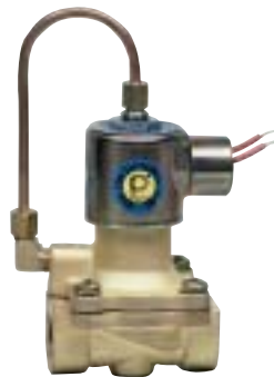
SERIES 80 INTERNAL PILOT