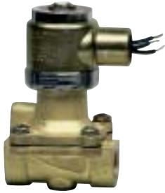
SERIES E80 INTERNAL PILOT PORT

EXPLOSION PROOF For hazardous locations proven and tested to meet UL and CSA requirements. Safe and continuous operation at maximum pressures.