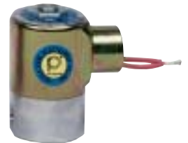
SERIES 20 2-WAY NORMALLY CLOSED

HIGH FLOW Two-way, large orifice valves for dump or quick fill.