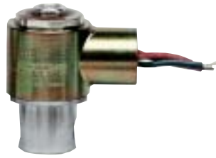
SERIES E50 2-WAY