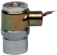
SERIES EH20 HIGH PRESSURE IMPACT TYPE 2-WAY NORMALLY CLOSED