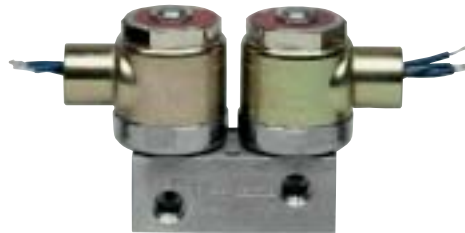
SERIES EH20 HIGH PRESSURE IMPACT TYPE 3-WAY NORMALLY CLOSED