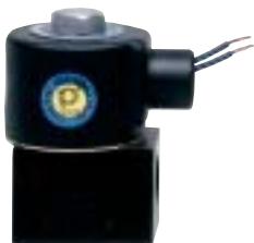
SERIES 70 HIGH FLOW 2-WAY NORMALLY CLOSED

HIGH FLOW Two-way, large orifice valves for dump or quick fill.