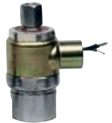
SERIES E20 3-WAY PIPED EXHAUST